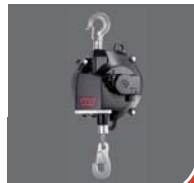
M7 Spring Balancer -pg248