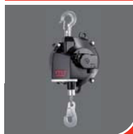
M7 Spring Balancer -pg248