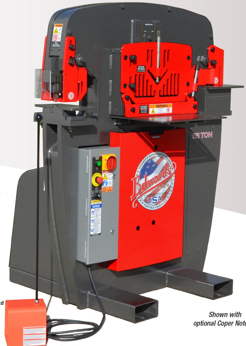
Shown with optional Coper Notcher