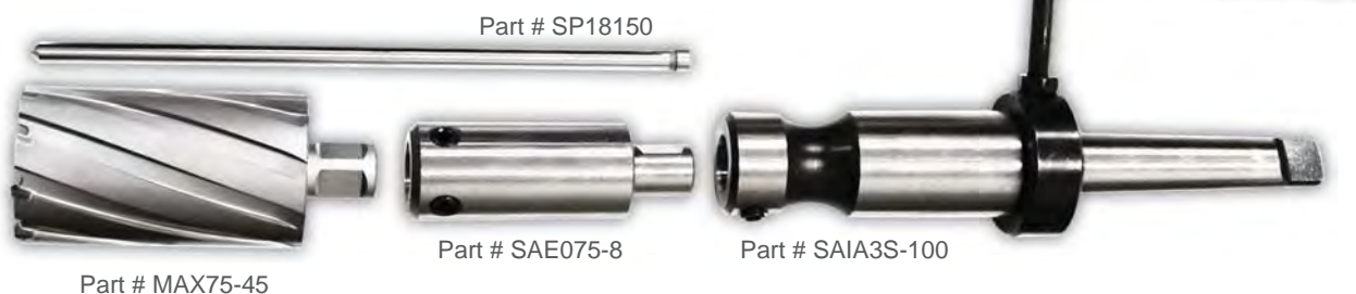
Part # MAX75-45

Our large range of magnetic base drilling machine accessories enables the most diverse range of jobs to be completed successfully.