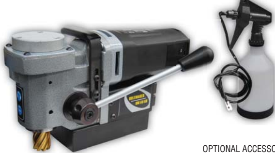
OPTIONAL ACCESSORIES & CONSUMABLES

*12mm twist drill capacity using Weldon Shank twist drill bits.