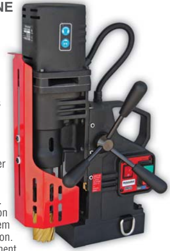
OPTIONAL ACCESSORIES & CONSUMABLES