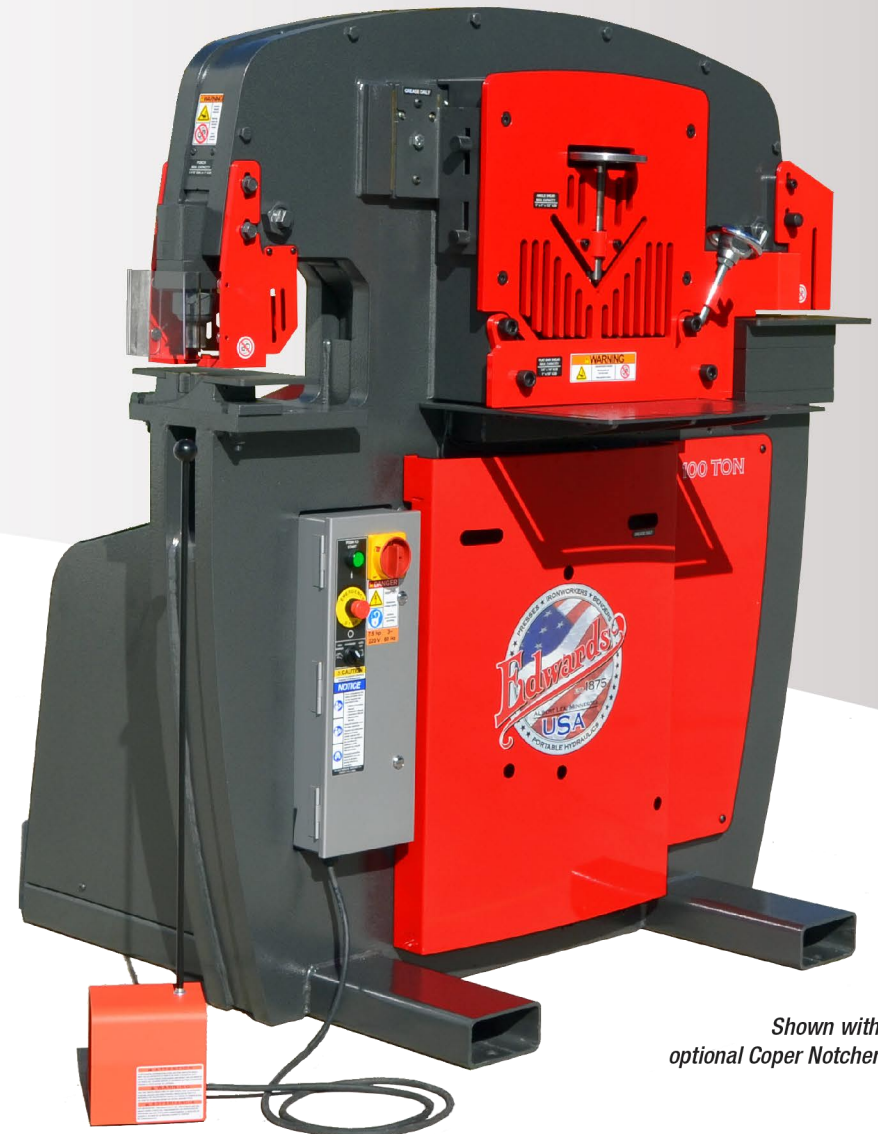
Shown with optional Coper Notcher

Height: 61-11/16" Width: 56-1/8" Depth: 45" Shipping Weight: 4650 lb